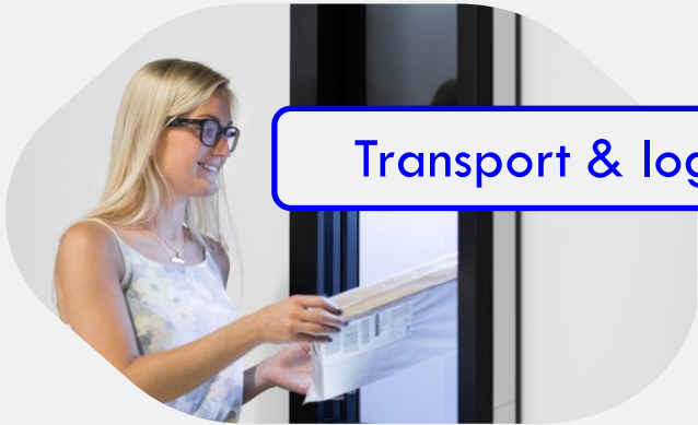
Transport & logistics